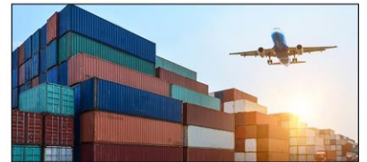
Logistics, Warehousing and Consolidation