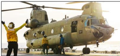
Procurement and Supplies